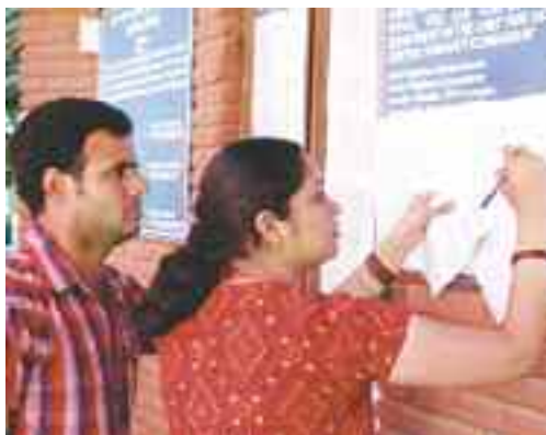
Students filling up admission forms at IGNOU.

Admissions are largely undertaken by the regional centres. In order to streamline and facilitate handling of voluminous data, the division has developed in-house software for error detection in admission and re-registration data, and the same has been provided to all regional centres. Besides, software for 'on-line' transmission of data by RCs — Regional Data Transfer System (RDTS) — has been developed and provided to all the RCs. The division has been successfully and effectively maintaining the database of over 2.6 million students on the rolls of the University.