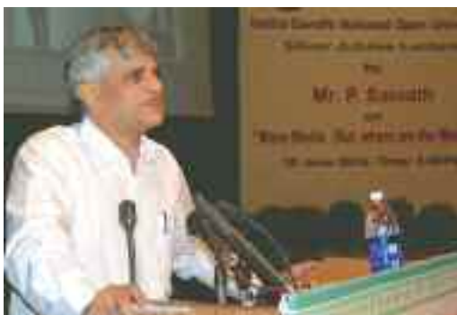
Veteran journalist P. Sainath delivering the Silver Jubilee Lecture.

Jubilee lecture titled 'Mass Media: But Where Are the Masses?' at the IGNOU campus on 30th June.