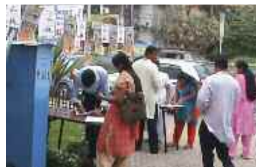
IGNOU learners busy preparing a survey on the World AIDS Day in Kochi.