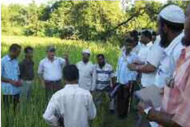
A training session on Pest Management in Agartala, Tripura.

the Ministry of Food Processing Industries, Govt. of India. The objectives of the programme are to: