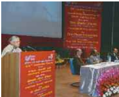
Chief Minister of Delhi Sheila Dikshit addressing the gathering at the 25th Foundation Day ceremony of IGNOU.