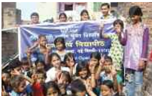
Children at Tigri, South Delhi. SOSW has adopted Tigri slum for community development.

development, where the main activities include: