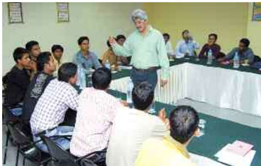
Learners of the Certificate Programme in Food and Beverages Services Operation during a hospitality training session at Sayaji Hotel, Indore, Madhya Pradesh.

This programme has been developed in collaboration with the National Council for Hotel