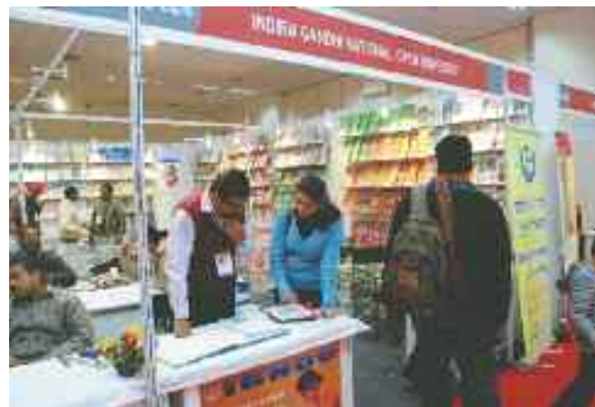
IGNOU stall at the 16th Delhi Book Fair.