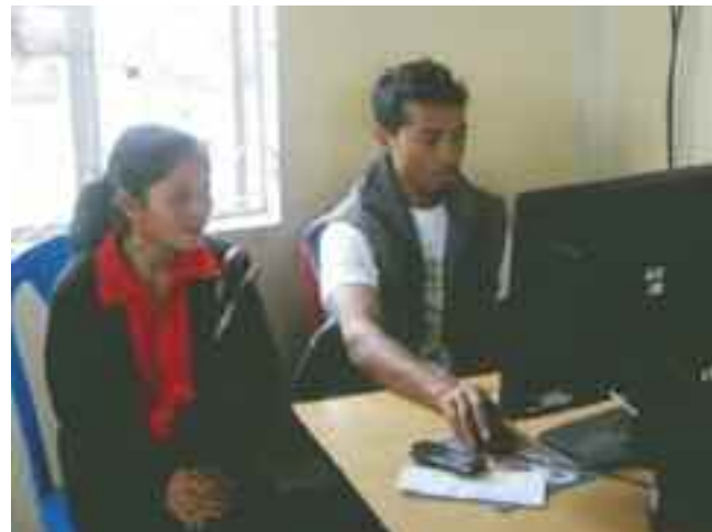
Learners during a computer literacy training programme in Meghalaya.

The University, with its stress on being learner-centric, has introduced a number of modular programmes in order to provide a greater and more flexible learning environment. All academic programmes have been assigned credit