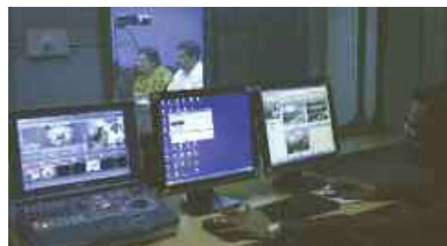
IGNOU faculty during an interactive session with MBA learners of Africa, at an EMPC studio.

GD-1 is a 24-hour exclusive national educational channel, which telecasts educational programmes for target audiences of different age groups. Hence, programmes of National Institute of Open Schooling (NIOS), IGNOU, NCERT/CIET, Rashtriya Sanskrit Sansthan, Department of Science & Technology (DST) and those of independent producers and foreign broadcasters are telecast through this channel. This channel recently