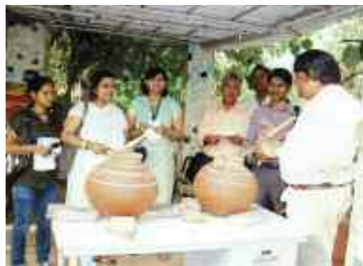
Students of the COF programme undertaking practical work at IGNOU.

This programme has been developed in collaboration with the IGNOU Regional Centre,