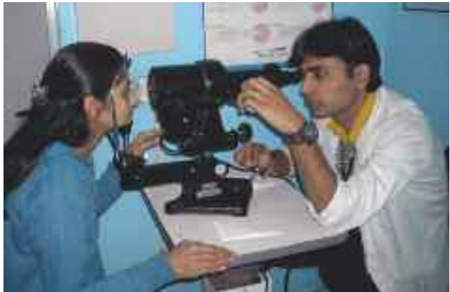
A student of B.Sc. (Hons) in Optometry & Ophthalmic Techniques (BSCHOT) performing an eye examination at his study centre.