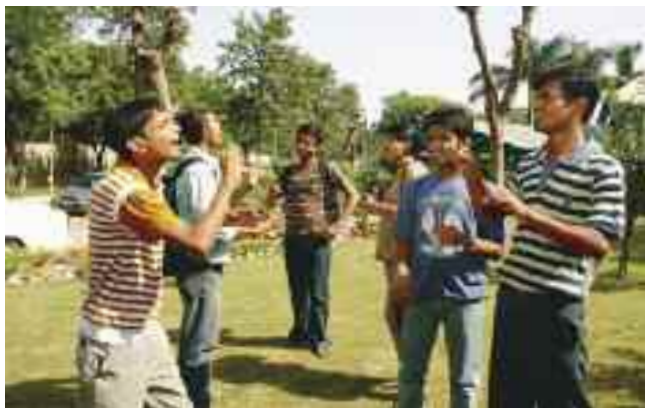
Students of the B.A. in Applied Sign Language Studies programme during a discussion.

At present, IGNOU is offering academic programmes in 36 countries across the globe through 67 Partner Institutions. (The names and addresses of the partner institutions in these countries are provided towards the end of the Profile.) Till date, IGNOU has a cumulative enrollment of nearly 35,848 international students, which is likely to increase with the intervention of technology and quality learner support services.