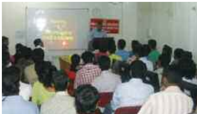
An induction meeting at a programme study centre under RC Delhi-3, in July, 2010.

The University is committed to quality in teaching, research, training and extension activities, and acts as a national resource centre for expertise and infrastructure in the ODL system. The University has established the Centre for Extension Education, National Centre for Disability Studies and National Centre for