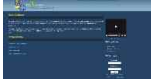
The main page of the FlexiLearn platform.

IGNOU initiated the development of a knowledge repository in October, 2005, to store, index,