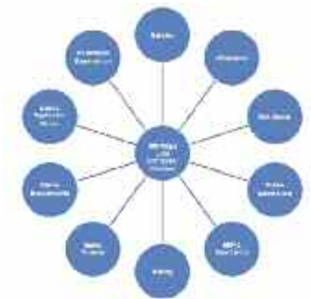
The diagram showing Computer Division's 100 Mbps link.

Computer Division. The campus LAN consists of about 40 LANs covering the various buildings of the campus. This network is also supported with Wi Fi wireless connectivity at select places, which is maintained by the Computer Division.