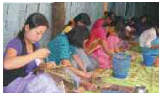
Participants at a training session on Kouna Crafts in Imphal, organised by IIVET.