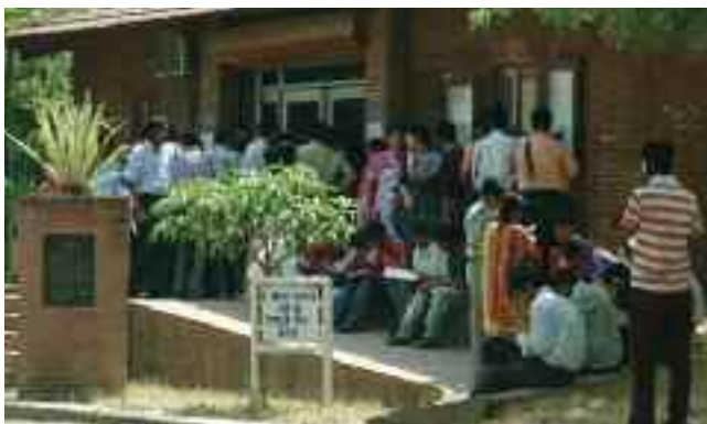
Learners at the Student Service Centre at IGNOU.

It also redresses the students' grievances such as non-receipt of letters, confirming admission in the academic programme, non-receipt of study material, non-receipt of admit card for appearing in the term-end examination, non-declaration of results of the term-end examination, non-inclusion of marks/grades of the assignments and projects in the grade cards, change in the address, change in the study centre, change in the medium of instruction, etc. It caters to the learners visiting the centre in person and also those who approach through telephone, e-mail and post. The SSC also takes care of the facilities being provided to the