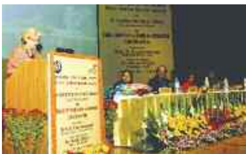
Irina G. Bokova, Director General, UNESCO, delivering the IGNOU Silver Jubilee Lecture.