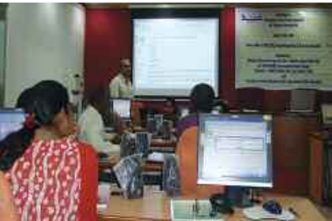
Participants at a Wiki workshop on 'Development of Online Training Modules', organised by DEP-SSA and ACIL.

This is a nodal centre for distance education activities under the SSA, funded by MHRD, Govt. of India. It was launched in 2003 as an upgraded project of the erstwhile DEP-DPEP (Distance Education Programme-District Primary Education Programme), which had been in operation in 18 states in the country. As an integral component of SSA, this national project aims at providing need-based, local specific in-service training for teachers and other functionaries involved in elementary education programme supplemented through distance mode.