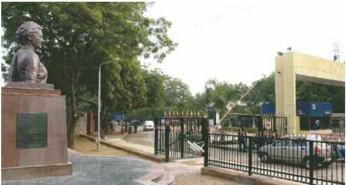
The bronze bust of late Smt. Indira Gandhi, designed by Padmashri Ram Sutar, at the entrance of the IGNOU campus in Maidan Garhi, New Delhi.