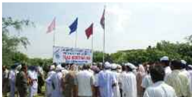
Freedom fighters attending the flag-hoisting ceremony on the occasion of the 68th anniversary of the Quit India Movement on 9th August, 2010.

Freedom movements which are under consideration by the Government of India;