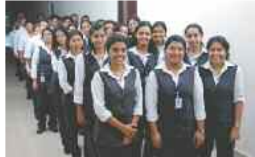
Students at the CIAL-Academy in Kochi, that offers programmes in Aviation and Airport Management, in collaboration with CCETC, IGNOU.

Towards fulfilling these objectives, the centre has entered into MoUs with several private and public enterprises, including the Department of Personnel and Training (DoPT), Govt. of India, and the Bombay Stock Exchange and National Stock Exchange (for