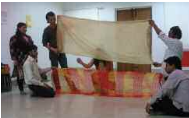
Students of Master of Performing Arts-Theatre Arts (MPA-THA) doing their practicals at the IGNOU campus.

Fine Arts education is an integral part of the development of each human being. It refers to the development of creativity through diverse range of creative activities and modes of expression. This School strives for a flagship role in the development and delivery of educational programmes in various disciplines of the Arts.