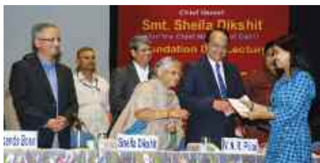
A learner receiving her Unique Identification (UID) number from Delhi Chief Minister Sheila Dikshit.

A recent initiative is the collaboration of IGNOU with the Unique Identification Authority of India (UIDAI) for implementation of the National Unique Identification Numbers (UID Numbers) project. Under this collaboration, IGNOU will cooperate and collaborate with the UIDAI in conducting proof of concept (POC) studies, pilots to test the working of the technology and process of enrollment into the UID database and subsequently a full roll out of the UID project. IGNOU has the distinction of being the first university in India to be appointed as a UIDAI Registrar, reinforcing the fact that it is the People's University.