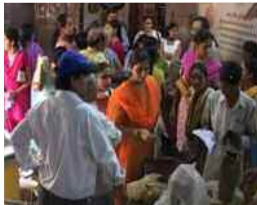
CCDP learners at the IGNOU-KVIC study centre.

The objectives of the programme are to disseminate information about the current development and reforms in the power distribution sector, generate awareness about the applications of emerging technologies and trends in the sector and educate personnel employed in the electrical power utilities or electricity sector about various aspects of power distribution management. Engineering Graduates/Engineering Diploma holders or Graduates or equivalent with two-year experience in power utilities or electricity sector are eligible to take admission. This programme has been developed in collaboration with the Ministry of Power, Govt. of India, USAID-India and the Power Finance Corporation, under the Distribution Reform Upgrades and Management (DRUM) project.