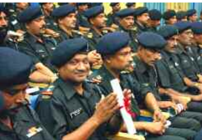
Army personnel receiving Associate Degrees, Diplomas and Certificates under Gyan Deep, the IGNOU-Army Community College Scheme, on 21st April, 2010.

At present, there are 465 community colleges registered with IGNOU, with 43,000 students approximately, offering a total of 1,615 programmes. A sizeable number of successful first batch students is already into gainful employment.