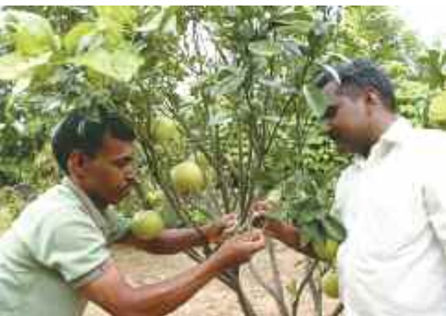
Grafting being undertaken at the Horticulture Cell of IGNOU.

It develops and maintains parks at different locations. Bio-pesticide is prepared at the nursery and is also being utilised for protecting the plants. The cell also grows vegetables without using