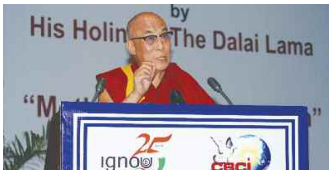
The Dalai Lama delivering the Third Annual Mother Teresa Memorial Lecture on 16th April, 2010.