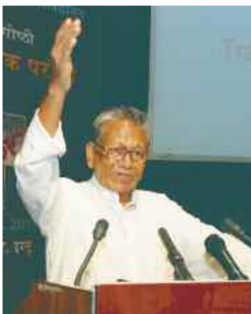
Noted writer Prof Manoj Das addressing the gathering at the seminar, titled 'The Traditions of Folk in Literature,' at IGNOU.

School of Humanities organised a two-day national seminar on 'The Traditions of Folk in Literature' in August 2010. The dialogue of the