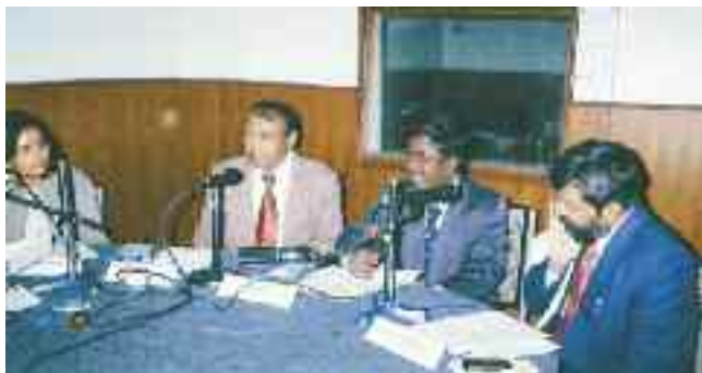
Gyan Vani FM broadcast from the Jabalpur GV station.

The Rajiv Gandhi Project for EduSat Supported Elementary Education (RGPEEE) is a collaborative project of MHRD, ISRO, IGNOU and the State Governments of Madhya Pradesh, Bihar, Chhattisgarh and Uttar Pradesh. The network has a provision of one teaching-end with a sub-hub at Jabalpur connected to 850 schools in the Sidhi District and 50 schools each in Sonbhadra in U.P., Korla in Chhattisgarh and Vaishali in Bihar. A two-hour live programme, from 10.00 to 12.00 hours, and a repeat programme from 2.00 to 4.00 p.m., are being telecast through this network.