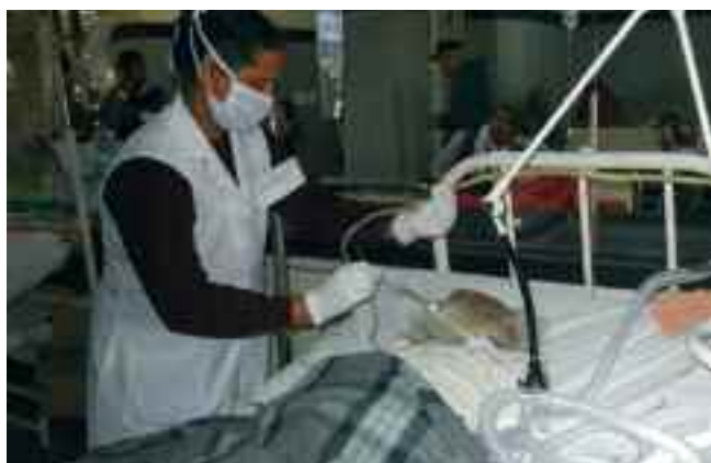
A student of Post Basic Bachelor of Science (Nursing) (B.Sc. (N) (PB)) performing Endotracheal suctioning at Safdarjung College of Nursing, New Delhi.

This is the first medical programme which is being offered online. It aims to help graduates of different systems of medicine to learn a new therapy and