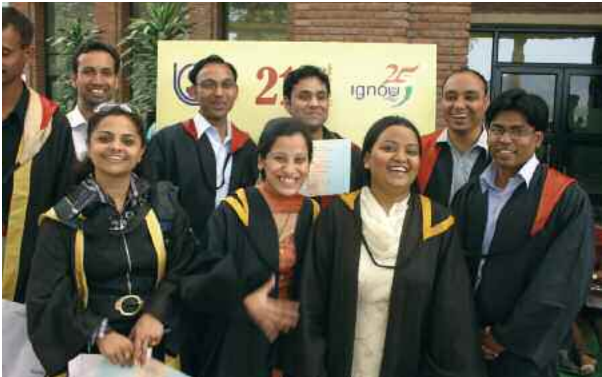
Learners at the 21st convocation ceremony on 15th March, 2010.

The Division is also responsible for the overall coordination of activities pertaining to the annual convocation. The main convocation is held at the headquarters, and simultaneously at all regional centres through teleconferencing mode via satellite, and students have the option to attend it either at the headquarters or the regional centre of their choice.