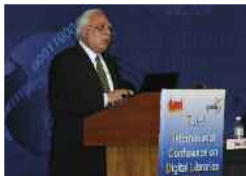
Union HRD Minister Kapil Sibal speaking at ICDL 2010, jointly organised by IGNOU and TERI.

Institute (TERI). The theme of the conference was 'Digital Libraries: Shaping the Information Paradigm.'