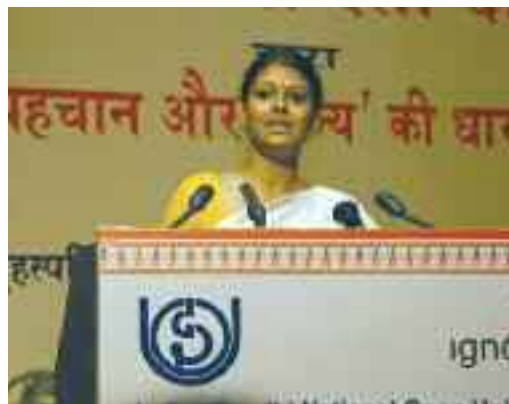
Actor-activist Nandita Das delivering the Silver Jubilee Lecture.