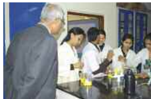
First-year students of M.Sc. (Chemistry) doing their practicals.

The main aim of this programme is to provide opportunities for higher science education to in-service people living in rural/remote areas and belonging to disadvantaged sections of