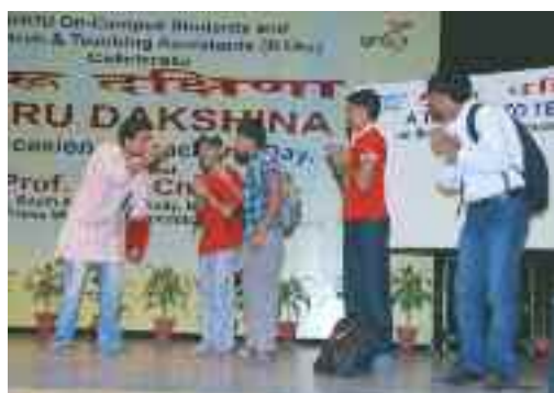
Learners pay tribute to teachers by staging a play titled 'Ek Adarsh Shikshak,' at IGNOU.