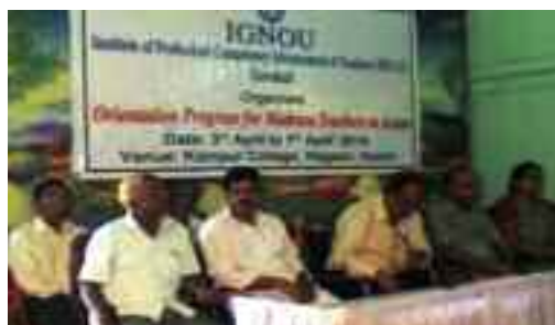
An orientation programme for madrasa teachers, organised by i-CAT, at Kampur College in Nagaon, Guwahati, 2010.

The Institute became operational in November, 2009 and would be addressing issues related to the professional development of the educators, such as developing ICT capabilities in teachers for utilising emerging technologies, inclusive education and imparting the vision and strategies for skill upgradation of teachers in the region.