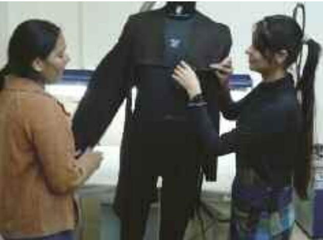
Students of BA in Fashion Design doing their practicals.

employed for specialised applications in apparel production management as applicable to both, export and the growing domestic sectors.