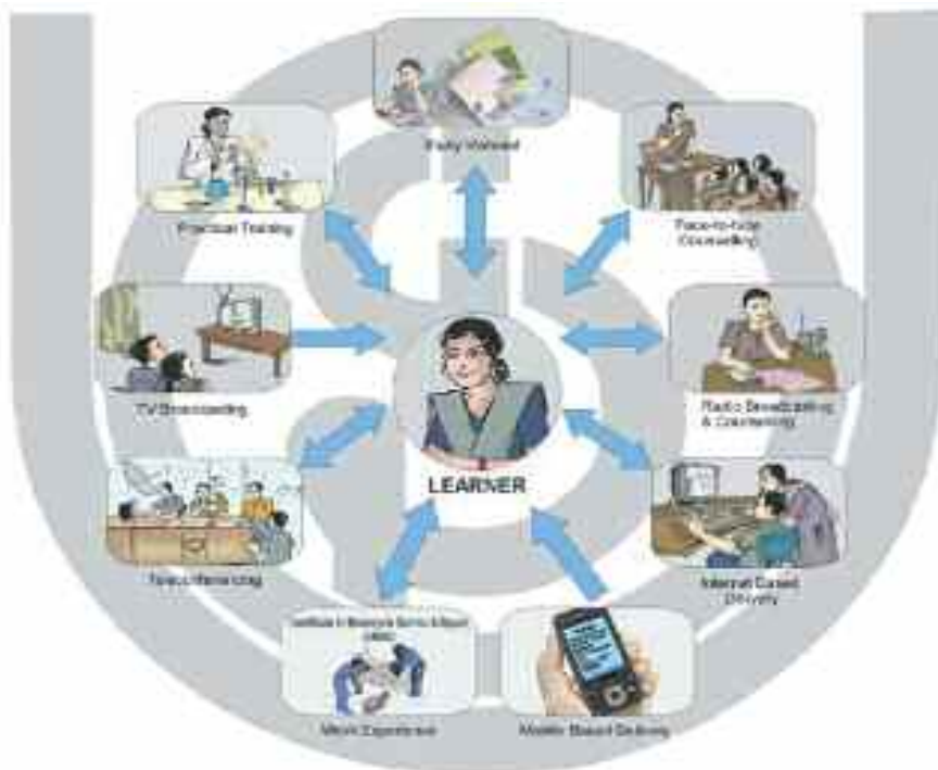
A graphic representation of the instructional modes available to IGNOU learners.

For courses in streams like sciences, computer sciences, nursing, medical sciences, education and engineering and technology, arrangements have been made to enable students to undertake intensive practical classes/practice teaching at select study centres/work centres/programme centres. While the traditional distance education delivery through print and study centre support is being strengthened, the University is strengthening the development of interactive multimedia content and learner support through video-conferencing and web-based platforms, by utilising both the EduSat and the Internet.