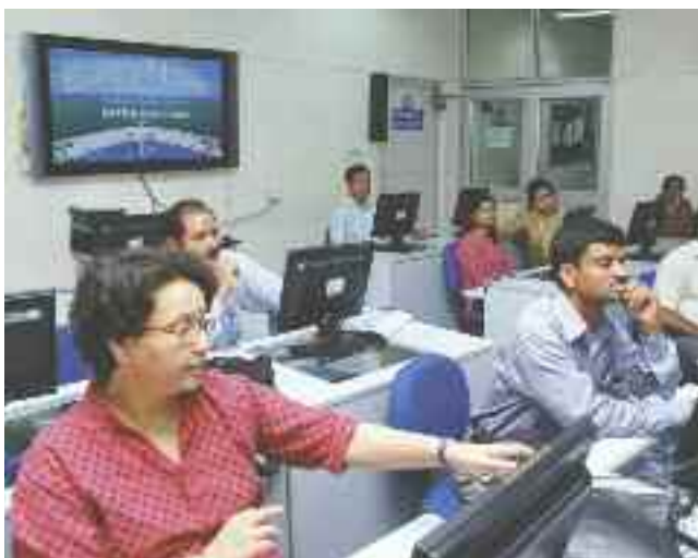
Participants at the IGNOU-CEMCA collaborative workshop on 'Easynow Open Source ICT Tools', organised by NCIDE.

Gold Medal for Innovations: IGNOU, through NCIDE, awards a Gold Medal for Innovation in Distance Education, to be awarded every year to