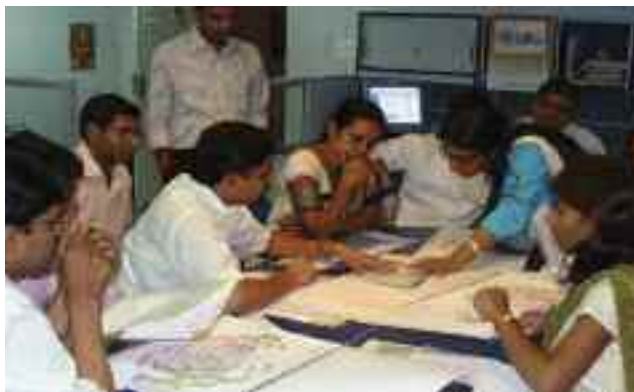
Participants at a workshop on Knowledge Models, organised by ACIIL at IIT-Kanpur, 2010.