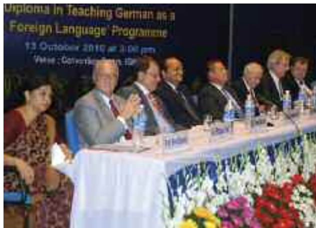
Ambassadors of Germany, Switzerland and Austria launching the Diploma in Teaching German as a Foreign Language (DTC) programme at IGNOU.

In collaboration with the Iran Culture House, New Delhi, IGNOU has initiated a Certificate in Persian Language (On-campus). The programme aims to provide a basic working knowledge of the Persian Language and the Iranian culture. The Iran Culture House, in collaboration with IGNOU, provides learning support along with the