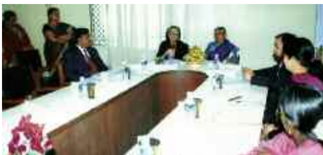
A DEC expert committee visiting the Mother Teresa Women's University, Kodaikanal, to evaluate the infrastructure, etc., for running their programmes in distance mode.