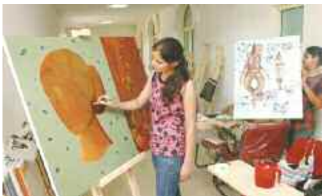
Students of Master of Fine Arts (Painting) programme finishing their assignments.

The Visitor of the University is the President of India, and is the highest authority of the University. The Board of Management is the highest executive body of the University. It is empowered by the Statutes to look after the management and administration of the revenue, finances and property of the University as well as the conducting of all academic and administrative affairs.