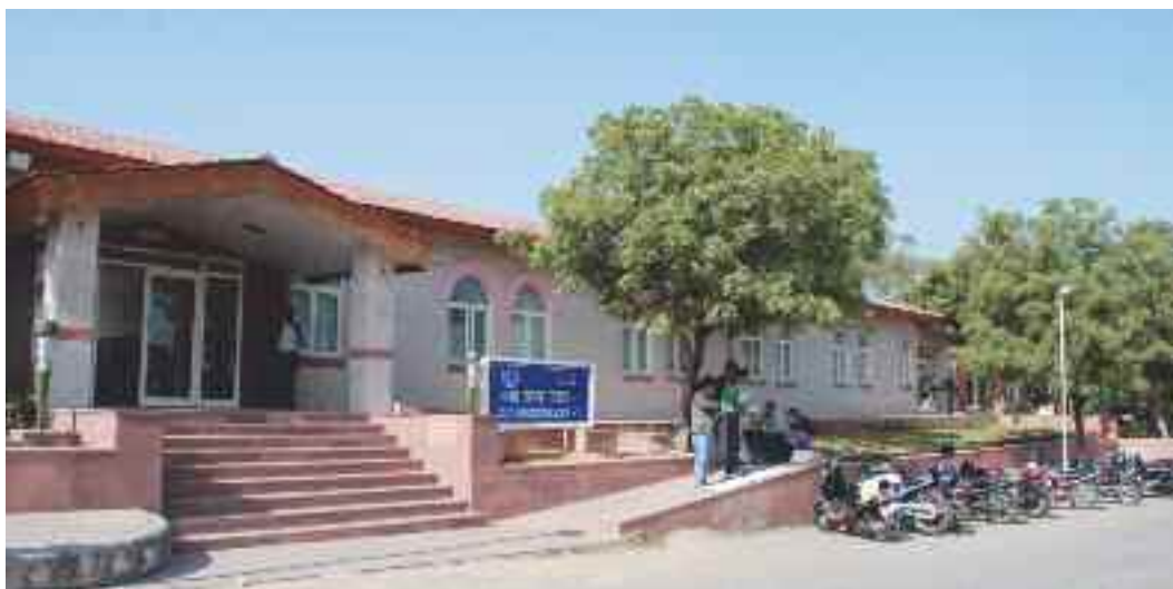
The Classroom Block-1 at the IGNOU campus.

The Construction and Maintenance Division (CMD) of IGNOU looks after the maintenance of the University estate, which includes temporary campus, Academic Block, EMPC building, DEC building, residential complex at IGNOU Campus, Asian Games Village housing and the regional centres in Delhi. The maintenance activities include supply of water, electricity, managing the