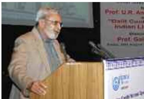
Prof U.R. Ananthamurthy delivering the Silver Jubilee Lecture on 'Dalit Contribution to Indian Literature' at the IGNOU Convention Centre on 20th August, 2010.

The Chair will also map out policies for national initiatives or for furthering the cause of science/mathematics education nationally/internationally. It will promote teaching, research and curricular development in the area.