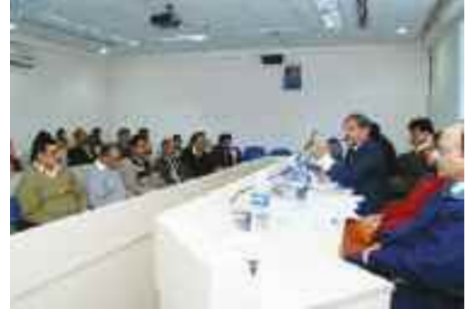
A workshop on TDS and e-filing conducted by Finance and Accounts Division.