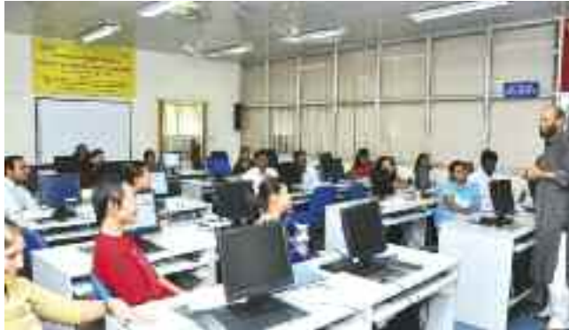
Participants at a training programme on Web 2.0 Tools for Distance Education for faculty members of IGNOU, organised by IUC.

disabilities, educationally backward and weaker sections in general;