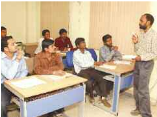
Students of Master's in Labour and Development during a classroom interaction.

The objectives of this programme are to: