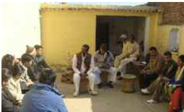
SOEDS students interacting with village panchayat members on Backward Region Grand Fund (BRGF) Plan of Mahendragarh district, Haryana.

and development of curriculum, teaching-learning, training, evaluation and research processes in adult education; and