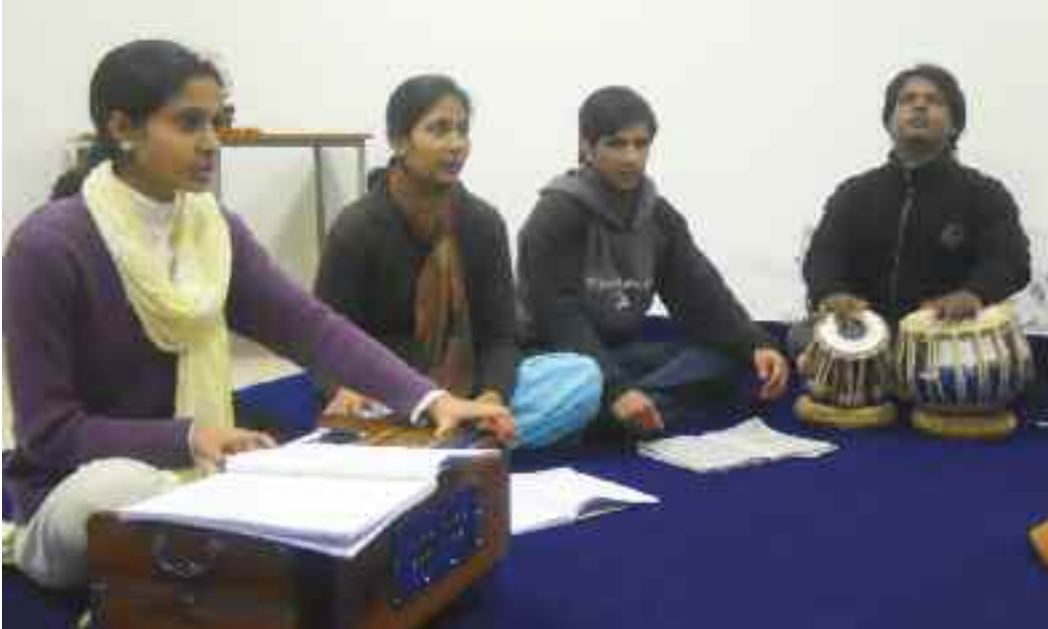
Students of Master of Performing Arts-Hindustani Vocal Music (MPA-HVM) in the class at the campus.

preparing a student to excel both academically and professionally. Practicals will also include independent student productions and a production under the direction of a well-known external expert.